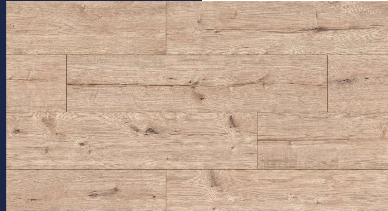
GIBSON OAK XL 1285 x 280 x 8