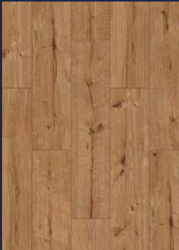
55086 XL ELBRUS OAK PAGE 66-67