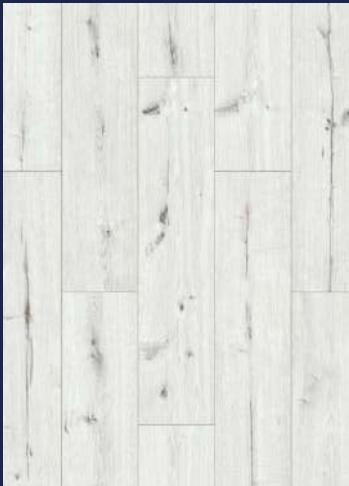
55091 XL TANAMI OAK PAGE 12-13