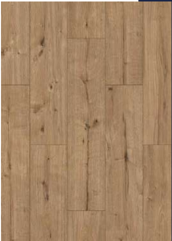
55085 XL ADLER OAK PAGE 60-61