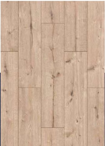
55087 XL GIBSON OAK PAGE 40-41