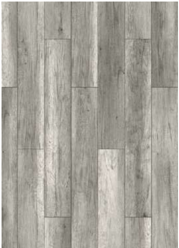
54812 S DAKAR OAK PAGE 24-25