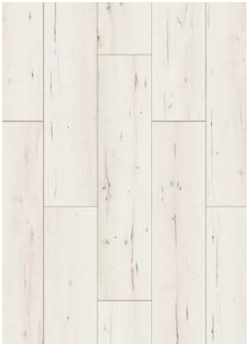
54832 XL FAMARA OAK PAGE 10-11