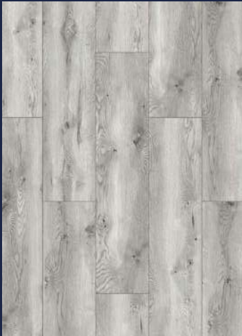
54847 XL SILVERSTONE OAK PAGE 22-23