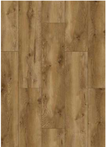
54845 XL SERENGETI OAK PAGE 70-71