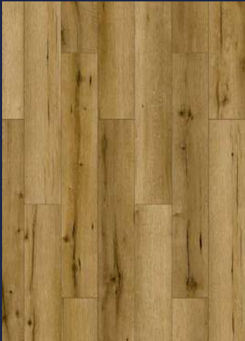
54810 S KRUGER OAK PAGE 72-73