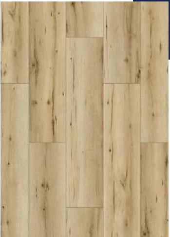
54831 XL DENALI OAK PAGE 52-53