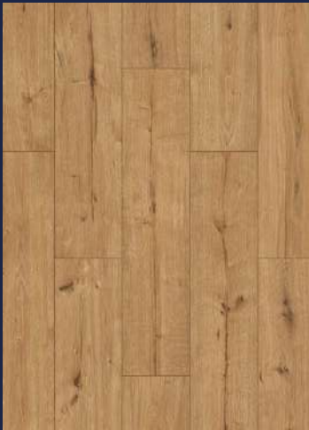
55088 XL KALAHARI OAK PAGE 64-65