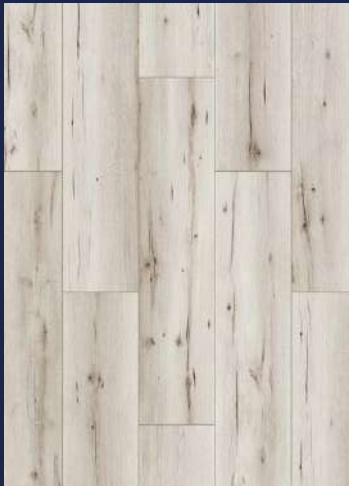
54835 XL PORTO OAK PAGE 14-15