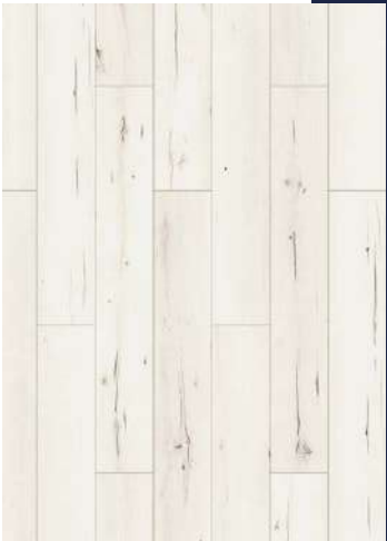
54808 S FAMARA OAK PAGE10-11