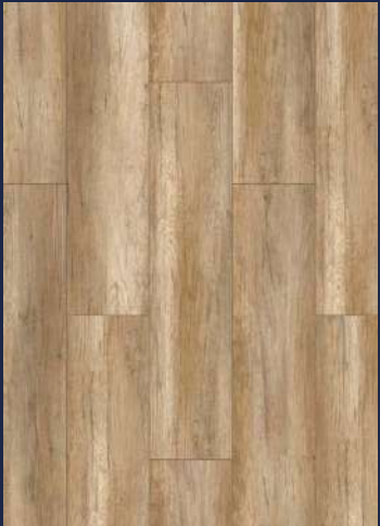
54814 XL SIPADAN OAK PAGE 50-51