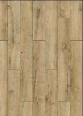
54806 S CONNEMARA OAK PAGE 44-45