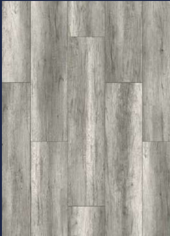
54823 XL DAKAR OAK PAGE 24-25