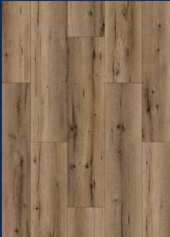
54836 XL KALYMNOS OAK PAGE 76-77