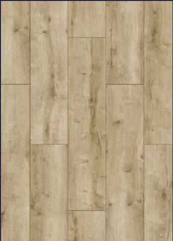
54820 XL PICOS OAK PAGE 48-49