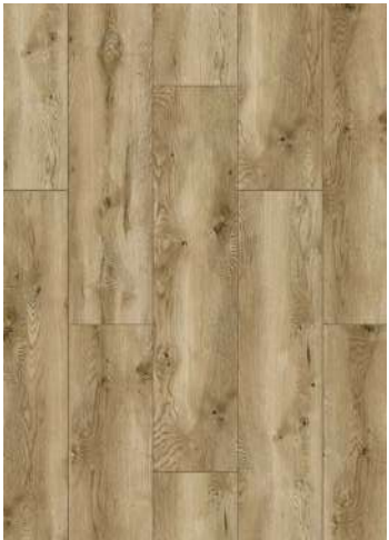
54842 XL FIORDLAND OAK PAGE 58-59