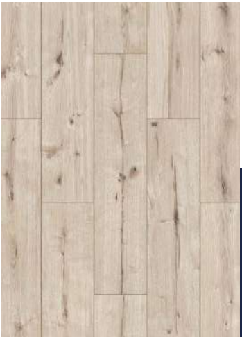
55090 XL SONORA OAK PAGE 34-35

PARAMETERS OF PARTICULAR PRODUCTS ARE SUBJECT TO UPDATES. THE INFORMATION CONTAINED IN THIS CATALOGUE DOES NOT CONSTITUTE AN OFFER WITHIN THE MEANING OF THE CIVIL CODE OR UNDER THE ACT ON SPECIFIC TERMS AND CONDITIONS OF CONSUMER SALE. COLOURS PRESENTED IN THIS CATALOGUE MAY DIFFER FROM THE PRODUCTS THAT ARE ON SALE.