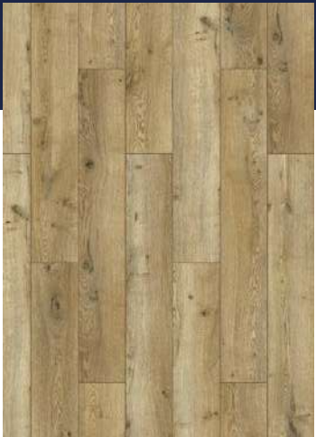
54805 S NAKURU OAK PAGE 56-57

PARAMETERS OF PARTICULAR PRODUCTS ARE SUBJECT TO UPDATES. THE INFORMATION CONTAINED IN THIS CATALOGUE DOES NOT CONSTITUTE AN OFFER WITHIN THE MEANING OF THE CIVIL CODE OR UNDER THE ACT ON SPECIFIC TERMS AND CONDITIONS OF CONSUMER SALE. COLOURS PRESENTED IN THIS CATALOGUE MAY DIFFER FROM THE PRODUCTS THAT ARE ON SALE.