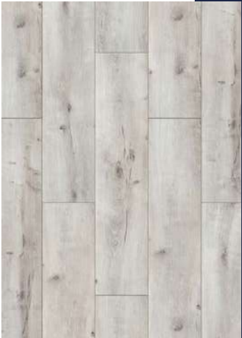
54822 XL ALGARVE OAK PAGE 20-21