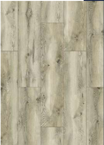
54848 XL INDIANAPOLIS OAK PAGE 26-27