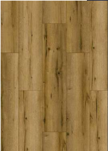
54830 XL KRUGER OAK PAGE 72-73