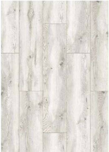
54846 XL HOSSEGOR OAK PAGE16-17