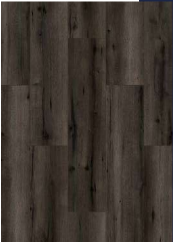
54837 XL HRADOK OAK PAGE 78-79

PARAMETERS OF PARTICULAR PRODUCTS ARE SUBJECT TO UPDATES. THE INFORMATION CONTAINED IN THIS CATALOGUE DOES NOT CONSTITUTE AN OFFER WITHIN THE MEANING OF THE CIVIL CODE OR UNDER THE ACT ON SPECIFIC TERMS AND CONDITIONS OF CONSUMER SALE. COLOURS PRESENTED IN THIS CATALOGUE MAY DIFFER FROM THE PRODUCTS THAT ARE ON SALE.