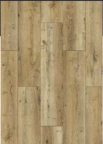
54813 XL NAKURU OAK PAGE 56-57