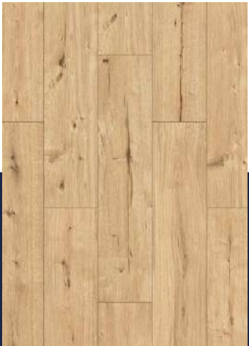
55092 XL ATAKAMA OAK PAGE 42-43