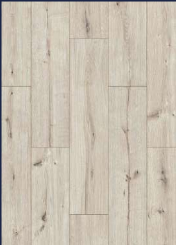
55089 XL PALMAR OAK PAGE 30-31