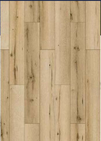
54811 S DENALI OAK PAGE 52-53