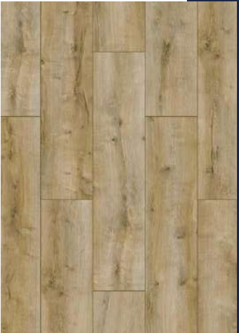
54807 XL CONNEMARA OAK PAGE 44-45