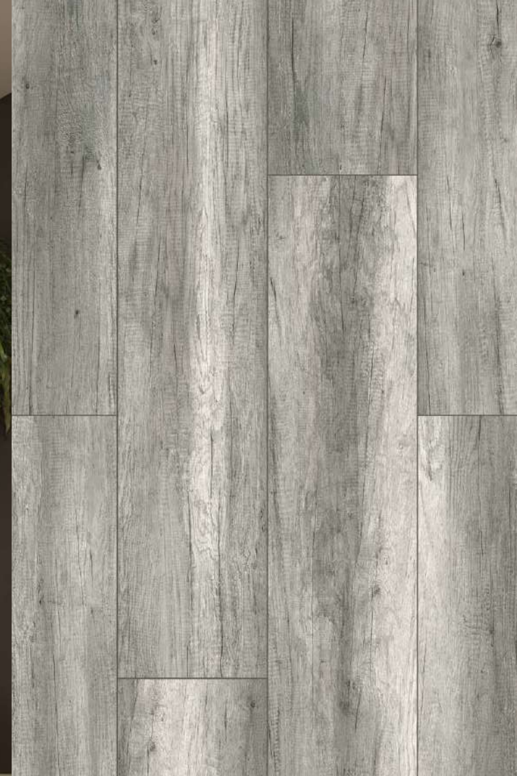
DAKAR OAK XL 1285 x 280 x 8