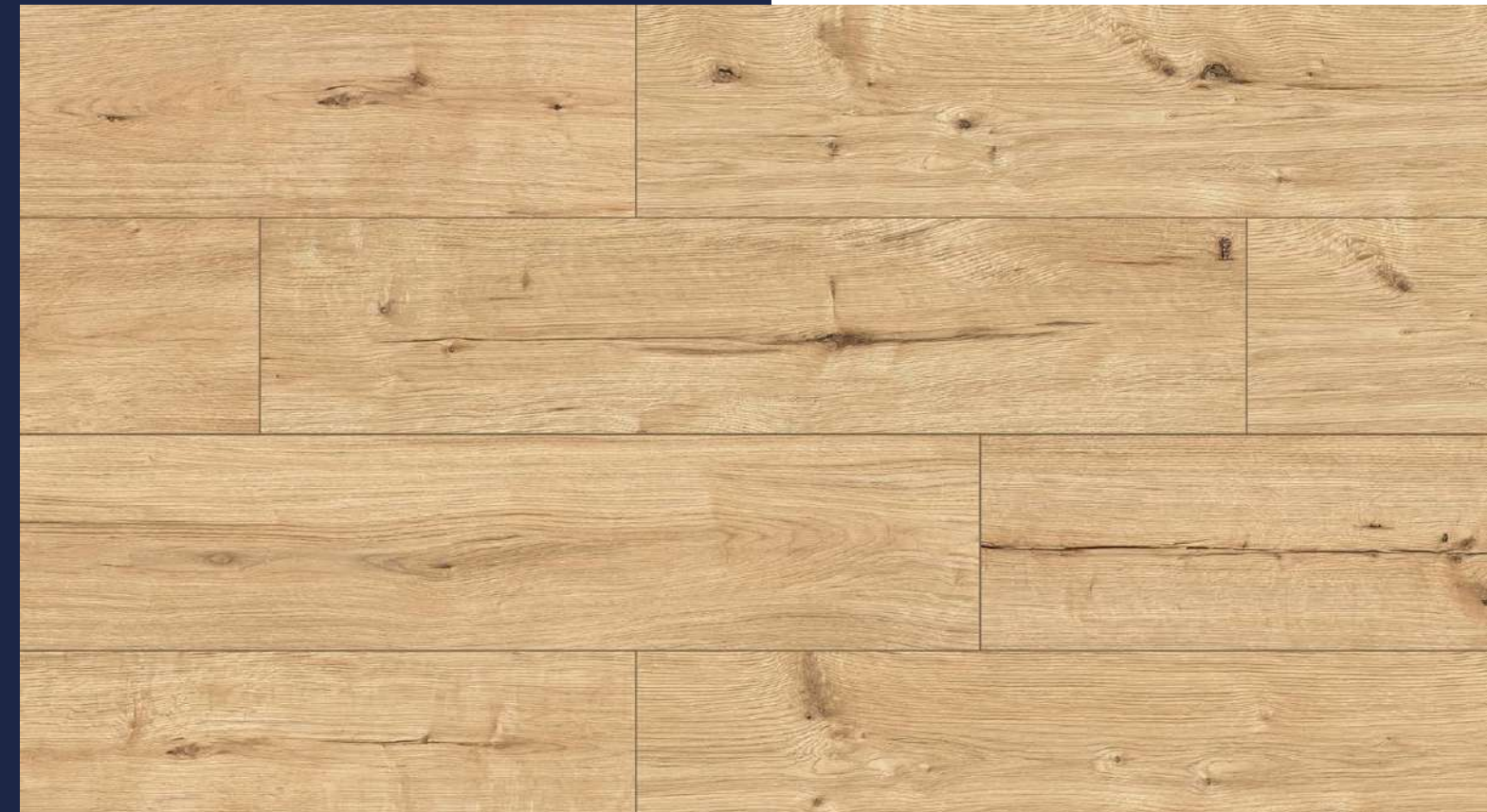
ATAKAMA OAK XL 1285 x 280 x 8