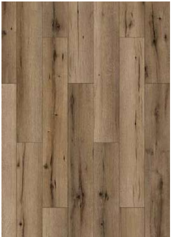
54809 S KALYMNOS OAK PAGE 76-77