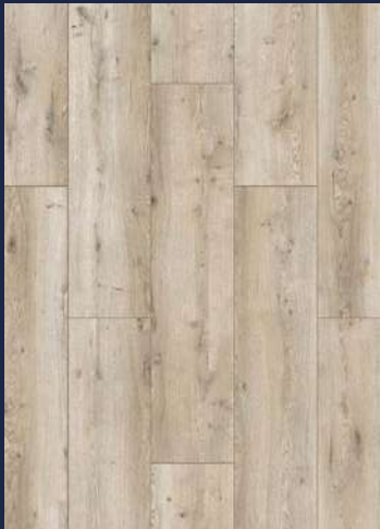
54821 XL YELLOWSTONE OAK PAGE 32-33

PARAMETERS OF PARTICULAR PRODUCTS ARE SUBJECT TO UPDATES. THE INFORMATION CONTAINED IN THIS CATALOGUE DOES NOT CONSTITUTE AN OFFER WITHIN THE MEANING OF THE CIVIL CODE OR UNDER THE ACT ON SPECIFIC TERMS AND CONDITIONS OF CONSUMER SALE. COLOURS PRESENTED IN THIS CATALOGUE MAY DIFFER FROM THE PRODUCTS THAT ARE ON SALE.