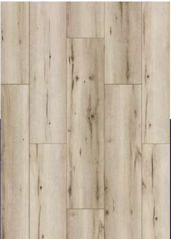
54833 XL GALAPAGOS OAK PAGE 36-37